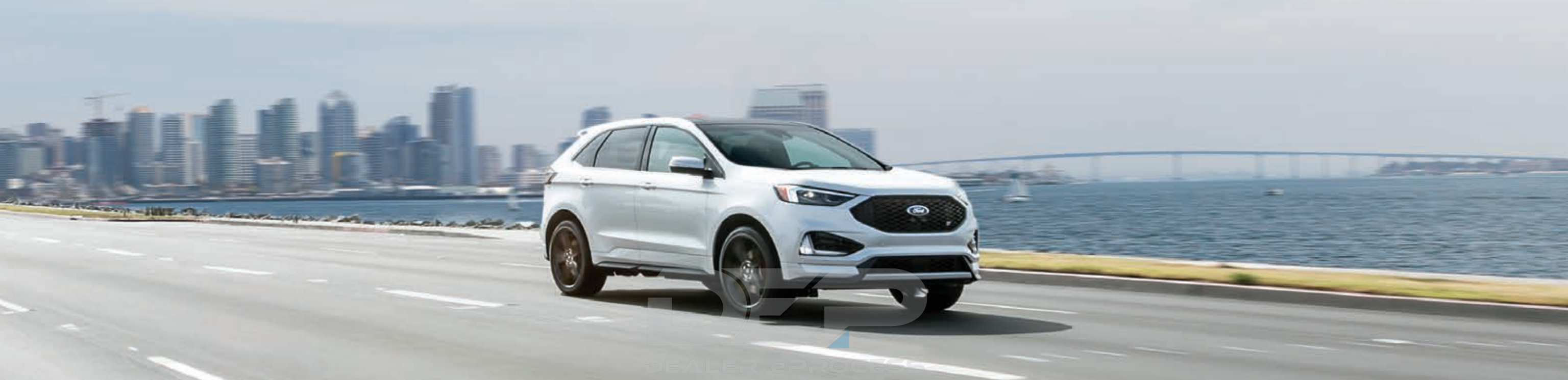
ST. Star White Metallic Tri-coat 7 Available ST Performance Brake Package. Available equipment.

1. Navigation services requires SYNC® 4 and FordPass™ Connect, complimentary Connected Service and the FordPass App (see FordPass Terms for details). Eligible vehicles receive a complimentary 3-year trial of navigation services that begins on the new vehicle warranty start date. Customers must unlock the navigation service trial by activating the eligible vehicle with a FordPass member account. If not subscribed by the end of the complimentary period, the connected navigation service will terminate, and the system will revert to embedded offline navigation. Connected service and features depend on compatible AT&T network availability. Evolving technology/cellular networks/vehicle capability may limit functionality and prevent operation of connected features. FordPass App, compatible with select smartphone platforms, is available via download. Message and data rates may apply. 2. Ford Licensed Accessory. 3. Restrictions may apply. See dealer for details. 4. Do not place additional floor mats or any other covering on top of the original floor mats. 5. Consult owner's manual for details on roof-rack load limits. 6. Ford does not recommend using summer tires when temperatures drop to approximately 45°F (7°C) or below (depending on tire wear and environmental conditions), or in snow/ice conditions. If the vehicle must be driven in these conditions, Ford recommends using all-season or snow tires. 7. Additional charge.