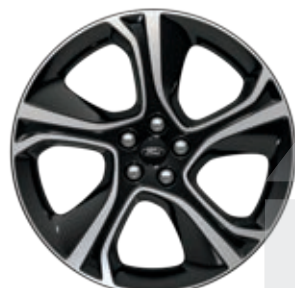
20" Bright-Machined Aluminum with High-Gloss Black-Painted Pockets Standard on ST