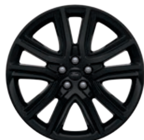
20" Premium Gloss Black-Painted Aluminum Standard on ST-Line