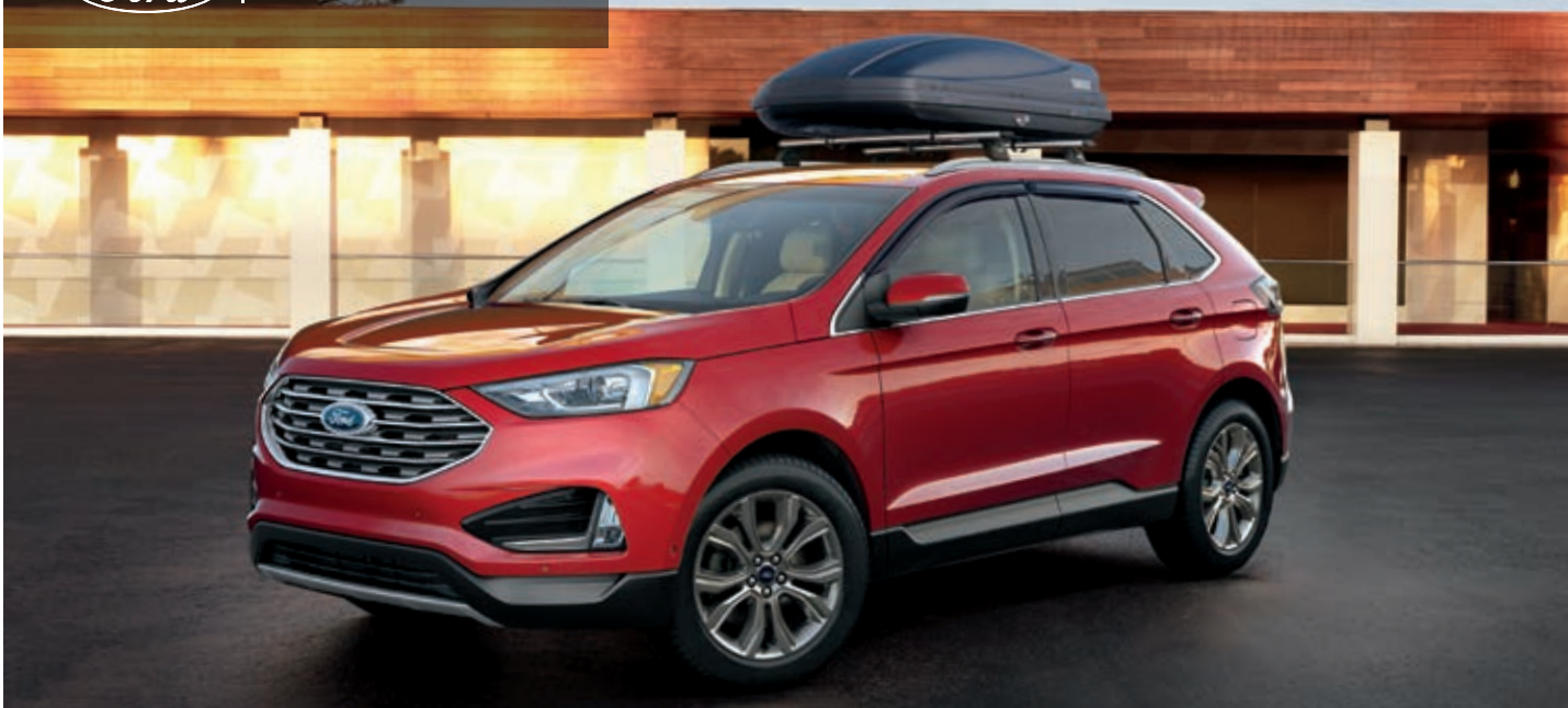
Titanium in Rapid Red Metallic Tinted Clearcoat 1 accessorized with smoked side window deflectors, 2 front and rear molded splash guards, roof-mounted crossbars, 3 cargo box, 2,3 and wheel lock kit