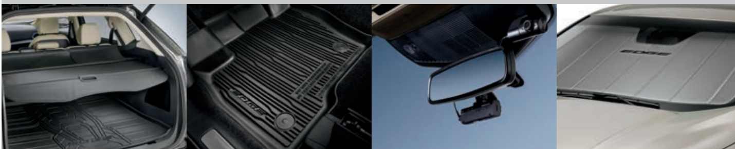
Cargo area protector and cargo cover