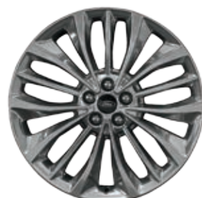
20" Polished Aluminum Included with Titanium Elite Package