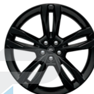
21" Premium Gloss Black-Painted Aluminum Optional; Included with ST Performance Brake Package